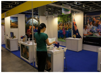
The New Zealand Booth at the Hong Kong Education Expo