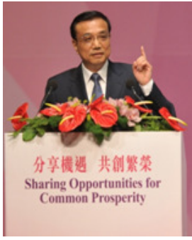
Chinese Vice-Premier Mr Li Keqiang addresses an economic forum in Hong Kong