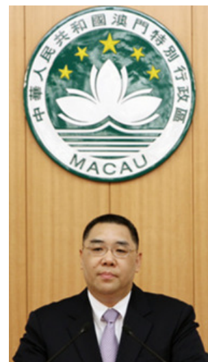
Chief Executive Mr Fernando Chui delivers the policy address

The average composite CPI for the first eight months of 2011 has risen by 5.37%. Macau's Monetary Authority expected inflation for 2011 to be slightly above 5%, and the unemployment rate to edge down to about 2.5% from the current 2.7%.