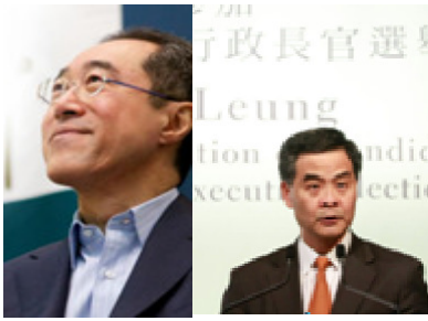
Chief Executive candidates: Mr Henry Tang (left) and Mr C Y Leung (right)