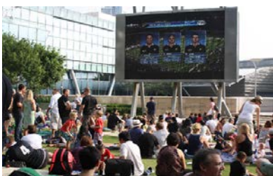
The New Zealand community in Hong Kong got together for the RWC2011 Final in support of the All Blacks

Among the crowd were guests of the Consulate-General and New Zealand Trade and Enterprise, who joined 500 plus people of all ages for the free outdoor screening organised by the New Zealand Chamber of Commerce with the help of the Consulate. To ease the nerves, New Zealand wine and beer was available for purchase, as was good ol' New Zealand pies which raced out the door.