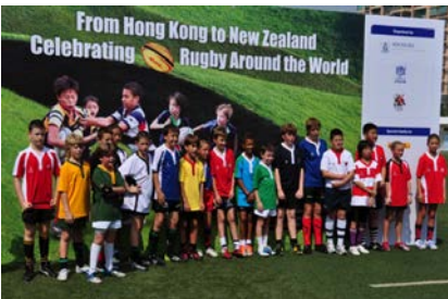
Representatives of country teams at the opening ceremony

Throughout RWC2011, NOW TV's Sports Channels screened footage of the tournament with messages from key organisers of the event, including the Consul-General.