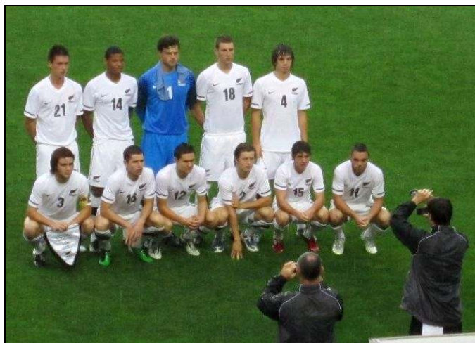
The Junior All Whites line up before their match against Nigeria.