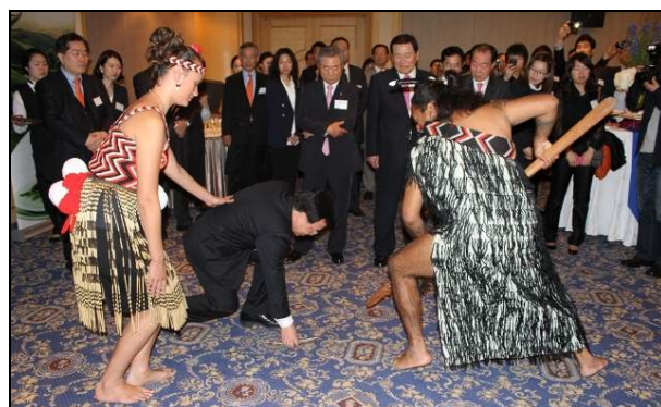
The guest of the honour participated in the powhiri.