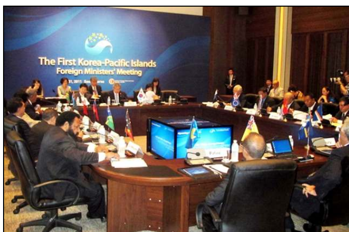
Korea hosted the first Korea-Pacific Islands Foreign Ministers Meeting in Seoul on 31 May.

“New Asia Initiative.” Following the meeting, the participating Ministers adopted a joint statement specifying ways to bolster cooperation, including the Korean Government’s increase of the Korea-Pacific Islands Forum (PIF) fund from $US300,000 to US$1 million. According to the Korean Foreign Ministry, “the first and highest-level meeting between Korea and the entire group of the Pacific Island countries laid the groundwork for the Korean Government to expand its network of diplomatic cooperation as well as its substantive cooperation with the region in the fields of resources and distant-water fisheries.”