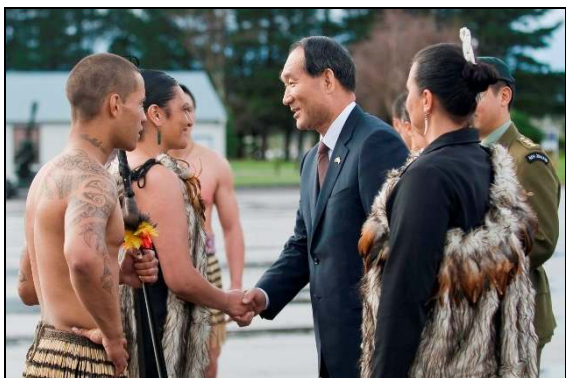
Minister Park receives a Maori welcome at Linton Army Camp.

was granted by New Zealand's Governor-General, allowing the presentations to take place some 60 years after their initial award. During his visit Minister Park also had bilateral meetings with his counterpart Judith Collins, Minister for Veterans' Affairs, and Dr Wayne Mapp, Minister of Defence.