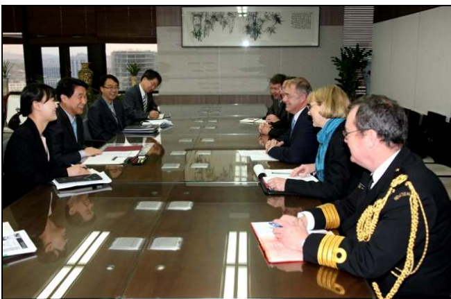
Minister Mapp (third from right) discussed science cooperation with Minister Lee Ju-ho (second from left).

Minister Wayne Mapp, who holds both the Defence and Science and Innovation portfolios, visited Korea 23-26 April. Minister Mapp had an active programme including meetings with Minister of National Defence Kim Kwan-jin, Minister of Education, Science and Technology Lee Ju-ho, and United Nations Command (UNC) Commander General Walter Sharp. New Zealand and Korea have a strong bilateral defence relationship, and during discussions the Minister emphasised the importance that New Zealand places on its contributions to international peace and security, including on the Korean Peninsula. The Minister received comprehensive briefings on the situation on the Peninsula through these discussions and a visit to the De-Militarized Zone (DMZ) and Joint Security Area at Panmunjom.