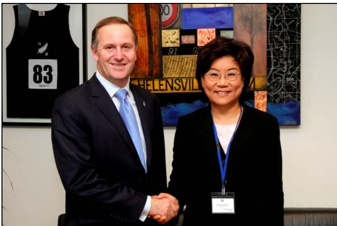
Rep Lee Hye-hoon meets with Prime Minister John Key.

Korea's National Assembly Representative Lee Hye-hoon recently visited New Zealand as the 2011 Prime Minister's Fellow. Rep Lee energetically engaged in an extensive programme of calls over a week that saw her meet with political and economic leaders in Auckland, Wellington, Christchurch and Queenstown. The highlight was a