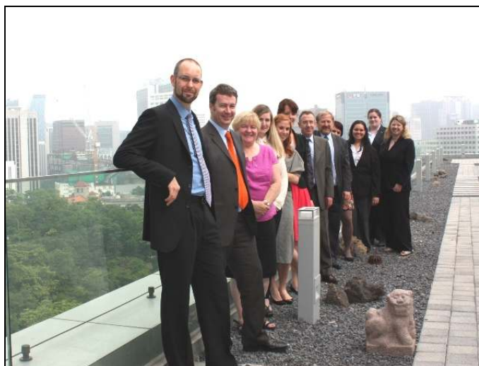
The workshop participants on the roof of the Embassy building overlooking Seoul.

On 9-10 June, the Embassy hosted an inaugural North Asia Trade and Market Access Workshop. Trade and market access work is an essential component of North Asian posts' operations, which each year directly assists exporters and benefits the New Zealand economy. The workshop brought together trade access officers based in Seoul, Beijing, Tokyo, Taipei, Hong Kong, Shanghai and Wellington to share experiences and insights, benchmark best-practice, identify collaborative ways further up our trade and market access game across the region to give New Zealand an edge internationally. The workshop covered a full range of topics from quarantine systems to regulatory issues to agricultural cooperation activities, as well as opportunities to engage with the Seoul-based New Zealand business community and colleagues from other embassies.