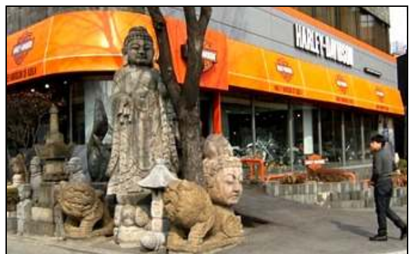
“An interesting juxtaposition – East meets West” at a motorbike shop in Seoul.

Jeong Dong Building, Level 8 (West Tower) 15-5 Jeong-dong, Jung-gu Seoul 100-784, Republic of Korea KPO Box 2258, SEOUL 110-110 Telephone 82-2-3701-7700; Fax 82-2-3701-7701 Website: www.nzembassy.com/korea ; E-mail: nzembse1@kornet.net