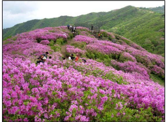
Azalea blossom in Mt Jiri in May

BILATERAL POLITICAL AND ECONOMIC UPDATES