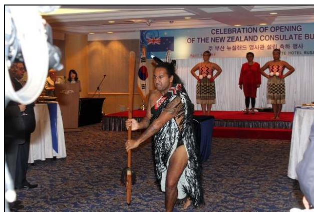
The opening ceremony began with a powhiri (welcome).