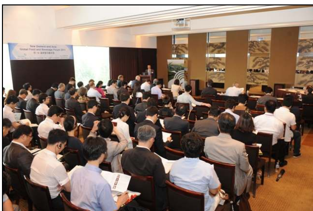
The New Zealand and Asia Global Food and Beverage Forum was attended by about 100 F&B industry people.

In particular, the nine experts discussed Asian and global perceptions and trends relating to meeting demand in a sustainable way, increasing demand for high-quality functional foods and leading R&D solutions from New Zealand in the F&B field.