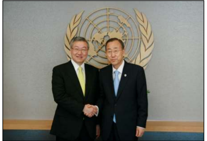
Korean Foreign Affairs Minister Kim Sung-Hwan (left) congratulates Secretary General Ban Ki-moon (right) on the re-election.

On 22 June United Nations (UN) Secretary General Ban Ki-moon, praised for his commitment to climate change and nuclear disarmament, was re-elected to serve a second five-year term in a unanimous decision at the UN General Assembly in New York. Secretary General Ban, a former South Korean Foreign Minister, was the only candidate after the 15-member UN Security Council unanimously recommended his re-election. As the chief of the 192 member international organisation, he pledged to keep leading the world body as a "bridge-builder" at a time of global change. His second term will formally begin on 1 January 2012 and run until the end of 2016.