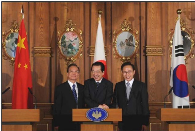
The fourth Korea-Japan-China Summit was held in Tokyo.

On 22 May the fourth Korea-Japan-China Summit was held in Tokyo. Korean President Lee Myung-bak, Japanese Prime Minister Naoto Kan and Chinese Premier Wen Jiabao agreed to increase cooperation on nuclear safety, as well as trade and regional security. The three leaders issued a joint declaration calling for the founding of an early notification system in emergencies, and sharing information and analysis of nuclear crises. The leaders also agreed to joint disaster training, and to dispatch relief teams when any nation in the region is hit by nuclear power meltdowns.