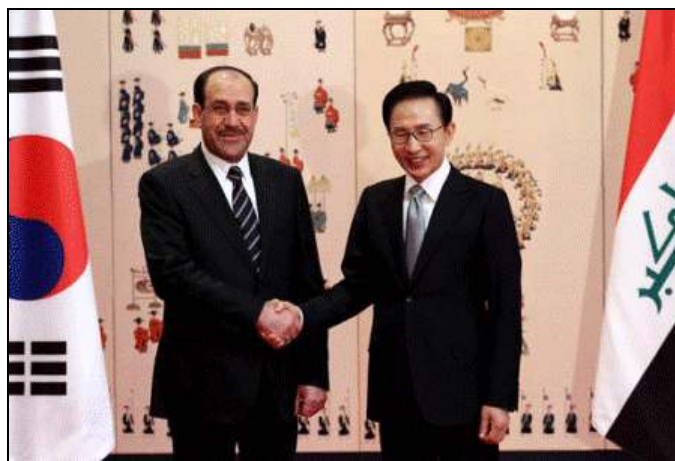
President Lee Myung-bak (right) and Iraqi Prime Minister Nouri Al-Maliki had a summit meeting on 28 April.

Last year Korea imported 60 million barrels of crude oil from Iraq, or about 7% of its total crude import of 872 million barrels. Asia's fourth-largest economy has been competing with China and India to secure energy reserves and ensure crude supplies at a time when oil prices are surging, while grappling to curb inflation in the face of costlier energy.