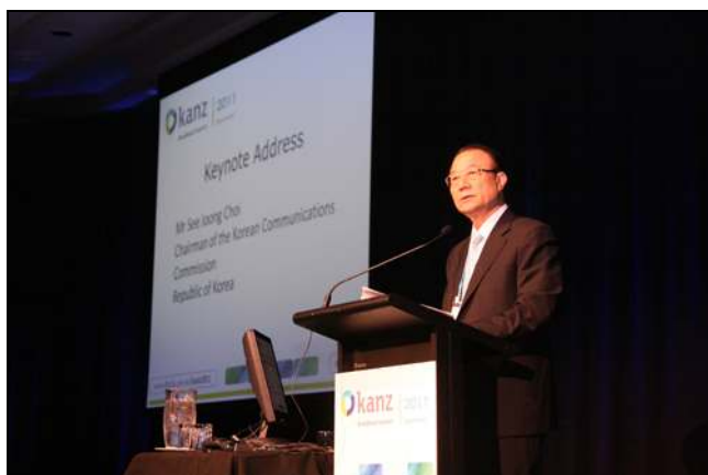
Korea Communications Commission Chairman, Choi See-joong, delivering a speech at the KANZ Summit.

7 th KANZ Summit in Korea, an event that the New Zealand contingent in Hobart is already looking forward to.