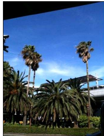
Blue sky and palm trees on Jeju Island in June.