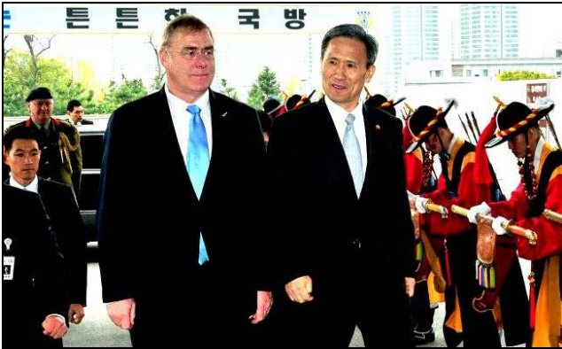
Minister Mapp (left) met with Korea's Defence Minister Kim Kwan-jin.

Minister Wayne Mapp, who holds both the Defence and Science and Innovation portfolios, visited Korea 23-26 April. Minister Mapp had an active programme including meetings with Minister of National Defence Kim Kwan-jin, Minister of Education, Science and Technology Lee Ju-ho, and United Nations Command (UNC) Commander General Walter Sharp. New Zealand and Korea have a strong bilateral defence relationship, and during discussions the Minister emphasised the importance that New Zealand places on its contributions to international peace and security, including on the Korean Peninsula. The Minister received comprehensive briefings on the situation on the Peninsula through these discussions and a visit to the De-Militarized Zone (DMZ) and Joint Security Area at Panmunjom.