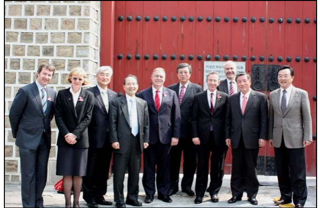
Minister Mapp (fifth from left) met with collaborating Korean research institute presidents.

Advanced Institute of Convergent Technologies (AICT). Science cooperation between Korea and New Zealand has been a real success story, and the Minister's discussions with his counterpart Minister Lee highlighted exciting new opportunities in areas as diverse as Antarctic research, green growth and new medicines and medical devices.