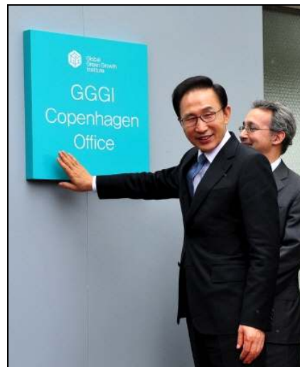
Attended by President Lee, Korea opened a GGGI branch in Copenhagen.

with the Danish Government for green growth support in developing countries. It also signed an MOU with Danfoss, Denmark's world's leading company in eco-friendly heating system.