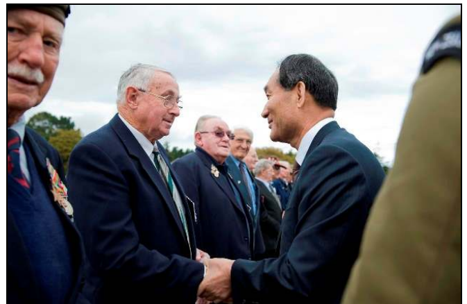
Korean Minister of Patriots and Veterans Affairs, Park Sung Choon, met with Korean War veterans during his visit to New Zealand.

Korean Minister of Patriots and Veterans Affairs, Park Sung Choon, visited New Zealand from 25 to 28 May to present the Korean Presidential Unit Citation to veterans of the New Zealand Army 16 th Field Regiment who served in the Korean War between 15 December 1950 and 1 November 1951. The Citation was originally presented in November 1951 in recognition of the Regiment's role in holding ground and halting the assault of communist forces during the Battle of Kapyeong. Recent approval for the presentation of the insignia