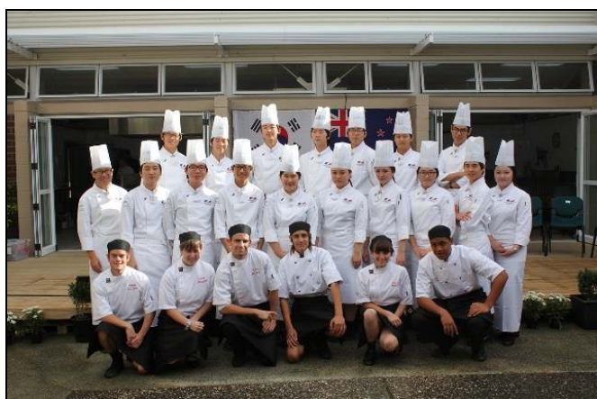
Some Korean Culinary Academy students study at Long Bay College.