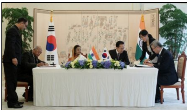
Korea and India signed a nuclear energy cooperation pact on 25 July.

On 25 July Korea and India signed a nuclear energy cooperation pact at a summit between Korean President Lee Myung-bak and Indian President Pratibha Patil held in Seoul, paving the way for Korea to export atomic power plants to the fast-developing nation. The two countries began to discuss the pact on nuclear energy cooperation in June last year when Indian External Affairs Minister S.M. Krishna visited Seoul. According to media reports, India currently has 20 power-generating reactors in operation, six under construction, and plans to build about 40 more by 2032. Korea has been stepping up efforts to export nuclear power plants since late 2009 when local firms won a US$18.6 billion project to build four atomic power plants in the United Arab Emirates over rivals such as the US, France and Japan. During the summit, the two leaders also agreed to strengthen cooperation and exchanges in the areas of economy and trade, security and defence industry.