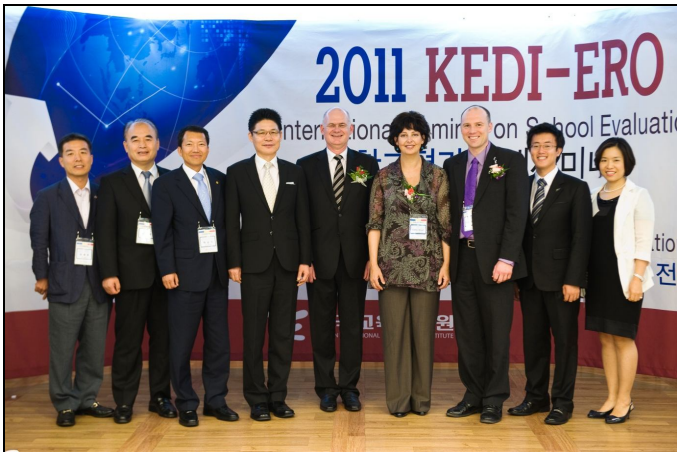
Delegation from the Education Review Office and officials from the Korean Educational Development Institute at the KEDI-ERO International Seminar on School Evaluation.