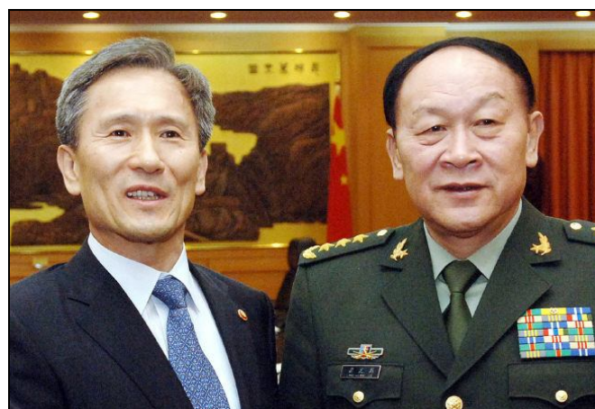
South Korean Defence Minister, Kim Kwan-jin (left) and his Chinese counterpart, Liang Guanglie.

annual Korea-China Strategic Dialogue to promote mutual understanding and bolster bilateral trust." The two Ministers pledged to make joint efforts to secure regional peace and stability, especially on the Korean Peninsula, but did not mention North Korea and the two attacks it carried out against the South last year, killing 50 people. The two sides also agreed to revive their military education exchange programme, which had been suspended since 2005, from next year. South Korea and China will also collaborate in international peace keeping operations, crackdowns on pirates and coping with non-military threats such as earthquakes and other natural disasters. The joint press statement was the first of its kind since Seoul and Beijing established diplomatic relations in 1992.