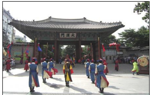
The Royal Guard changing ceremony at Deoksugung Palace in downtown Seoul.