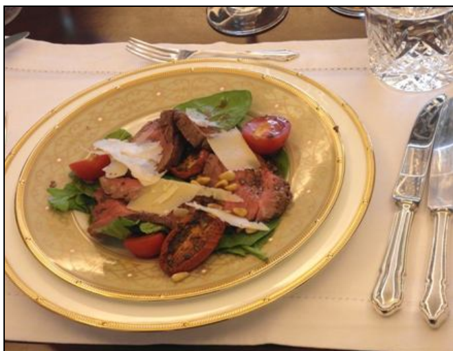
Beef fillet salad was served as entrée.

to learn about New Zealand beef and they have subsequently posted the details on their blogsites.