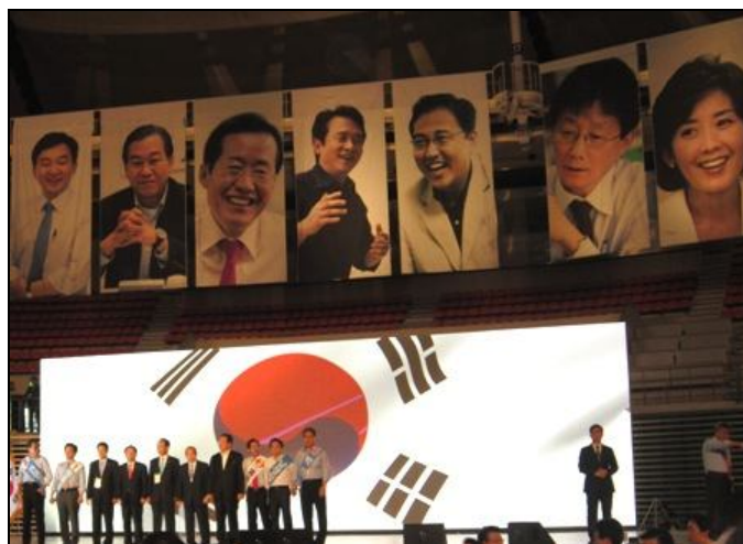
Rep Hong Joon-pyo (third photo from left) was elected the Chairman of the GNP at its national convention on 14 July.

overseeing the nominations for the 2012 legislative elections (April) and presidential election (December).