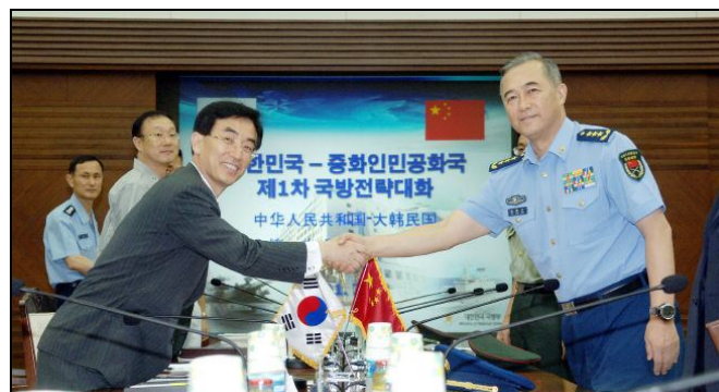
Following the Ministerial talks, the first South Korea-China Strategic Defence Dialogue was held in Seoul on 27 July.