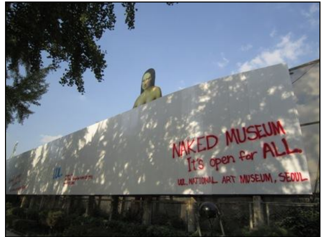
“Art Fence” of the construction site of National Art Museum, Seoul

BILATERAL POLITICAL AND ECONOMIC UPDATES