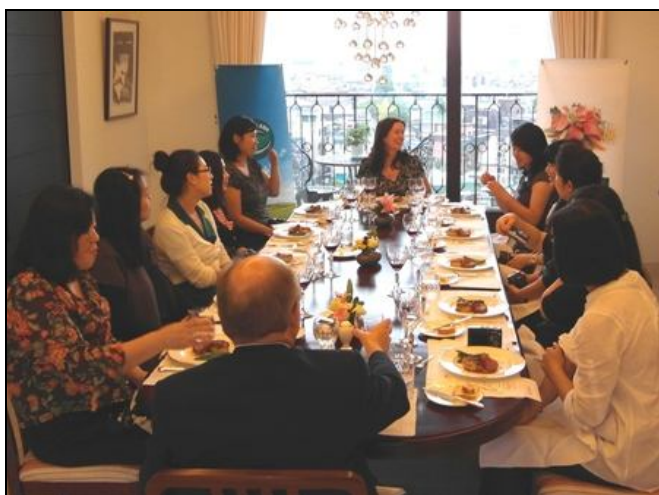
The bloggers enjoyed New Zealand beef dishes at the lunch.