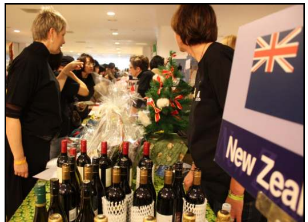
New Zealand’s presence at the 2009 SIWA and Diplomatic Spouses’ Charity Bazaar