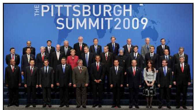
Korea was chosen to host G-20 Summit in November next year at the Pittsburgh Summit held in September.

At the G-20 Summit held in Pittsburgh in September, President Lee Myung-bak and Canadian Prime Minister Stephen Harper announced in a joint statement that the leaders of the world's 20 largest economies would meet in Canada in June and Korea in November for economic policy coordination next year. Korea's hosting of the G-20 Summit in November next year is seen as a breakthrough in the country's diplomatic history.