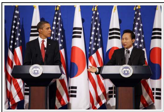
President Barack Obama and President Lee Myung-bak at the joint press conference held at the Blue House following the summit.

On the last leg of his first four-nation Asia tour, US President Barack Obama arrived in Seoul on 18 November for his two-day visit to the country, following visits to Japan, Singapore – where he attended the APEC meeting – and China. At the summit held at Cheong Wa Dae (Blue House) the following day – the third meeting between the two – Presidents Barack Obama and Lee Myung-bak focused on the issues of North Korea's denuclearisation, Korea-US FTA (KORUS FTA) and G-20 summit to be hosted by Korea next year and other global issues including climate change, green growth, and the broader issues of nuclear non-proliferation and counter-terrorism.