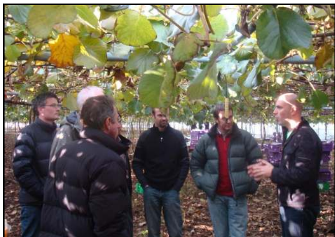
The Embassy team visited Zespri's operation in Jeju.

As well as gaining a greater appreciation of the level of cooperation between Zespri's New Zealand and Korean operations, the group visited a number of local growers, and packhouse and coolstore facilities owned and operated by the local growers' cooperative all of whom are affiliated with Zespri. As with the New Zealand industry, the Korean growers take an innovative approach to orchard management, working hard to try new ideas to increase yields and returns. A notable difference is that all kiwifruit in Jeju is grown in shadehouses to protect vines and fruit from typhoons. Post-harvest fruit management and packhouse operations are benefitting from New Zealand technology and experience, and the flow of ideas in both directions is helped by regular grower exchanges.