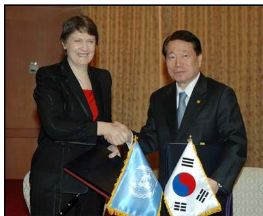
UNDP Administrator Helen Clark and Korean Foreign Affairs Minister Yu Myung-hwan

During her visit Helen Clark met with President Lee Myung-bak, Foreign Minister Yu Myung-hwan and members of the National Assembly. She also announced that the UNDP was in the final stages of considering a US$2.5 million assistance programme for DPRK, starting from 2010 and covering six projects including sustainable energy production.