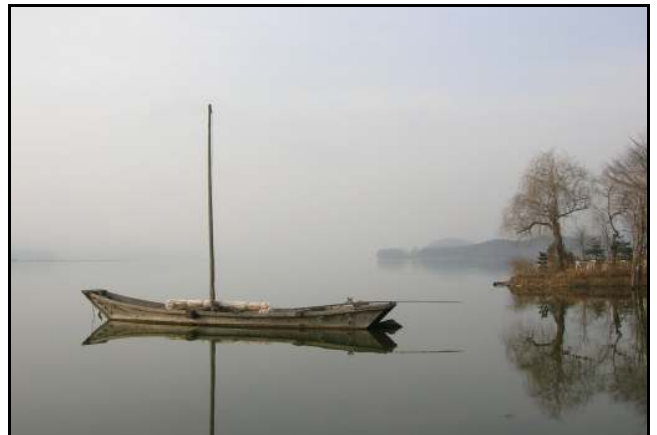
Still morning at meeting point of North and South Han Rivers