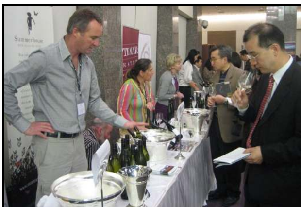
Korean guests tasted fine New Zealand wine at the New Zealand Wine Fair held in Seoul on 9 November.

On 9 November two major events were hosted at the Seoul Plaza Hotel to promote New Zealand wine in Korea. New Zealand Wine Growers brought a delegation of eleven wine companies from all regions of New Zealand, to introduce their wines to the market. NZTE supported the event by coordinating with in-market distributors representing another 14 wine companies to enable a major showcase for New Zealand wine. In all 115 wine labels were shown and poured over the course of the afternoon and evening events. As well as wine, New Zealand Meat and Wool provided beef for tasting, Aotearoa Seafoods provided greenshell mussels and Fonterra, through its customer Sangha, provided cheese to accompany the wine.