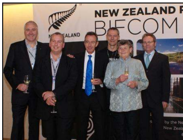
New Zealand delegation at the New Zealand reception held in Busan on 13 October.

NZTE Seoul participated in the Busan International Film Commission and Industry Showcase 2009 (BIFCOM) held on 11~14 October, with delegates from the New Zealand Embassy, Film New Zealand, Film Auckland, and HIT Lab NZ Ltd. BIFCOM is a strategic event for New Zealand and its film industry. Since its inception, NZ has used it to develop strong relationships within the Korean film industry.