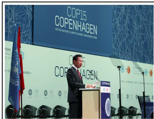
President Lee Myung-bak delivered a keynote speech at the UN Climate Change Conference in Copenhagen on 17 December.

On 17 November the Cabinet approved a plan to cut the country's greenhouse emissions by 4% from 2005 levels by 2020, making Korea the first emerging nation to set up a carbon reduction goal. The figure represents a 30% fall from the level predicted for 2020 if carbon emissions grew at their current pace. The Government chose the highest target among three possible scenarios proposed by the Presidential Committee on Green Growth on 4 August.