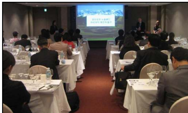
Presentations on New Zealand wine were given to Korean wine industry people.

and Riesling varieties from different regions of New Zealand.