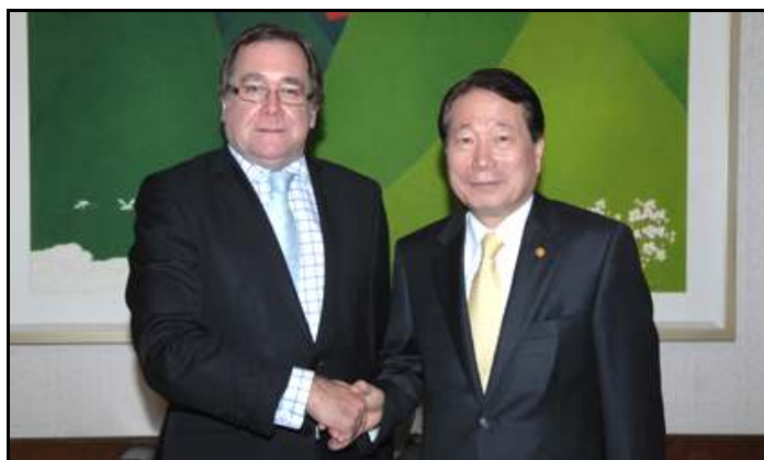
Hon Murray McCully and Korea's Foreign Affairs Minister Yu Myung-hwan

New Zealand Minister of Foreign Affairs, Hon Murray McCully, accompanied by Melissa Lee MP, visited Seoul from 26-27 October in response to an invitation from the Korean Minister of Foreign Affairs, Yu Myung-hwan. This was Minister McCully's first visit to Korea as Foreign Minister. During his visit, Minister McCully met with Prime Minister Chung Un-chan, Foreign Minister Yu and Minister of Unification Hyun In-taek. These meetings offered important opportunities to engage with the Korean Government on issues of mutual concern including the bilateral relationship, regional architecture, inter-Korean relations, climate change and the bilateral FTA under negotiation.