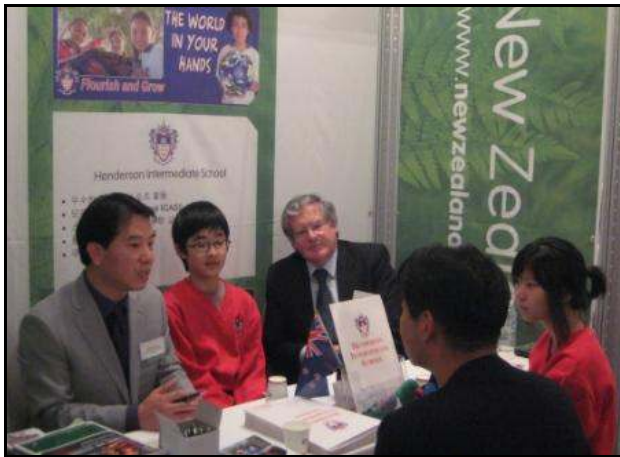
At the New Zealand Education Fair held in Seoul from 31 October - 1 November.

Education New Zealand was very happy with the numbers of visitors and feedback from participants. The location worked well, being close to – but separate from – a British Council education event. Promotion for the Fair included online and offline advertising, such as posters on subway trains and slots on the large City Vision TV screens that dot the Seoul landscape. Visitor numbers compared well to competing country events in the October-November recruitment season, such as for Australia, UK and Canada.