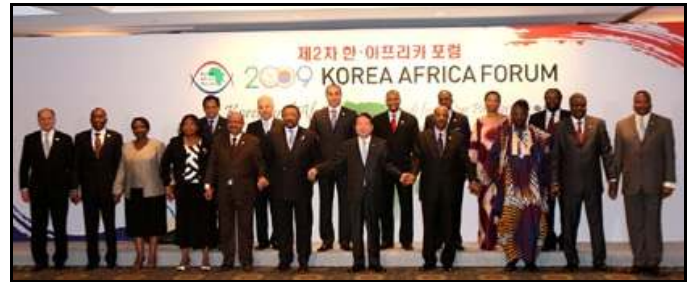
Representatives of Korea and the 53 member nations of AU at the second Korea-Africa Forum held in Seoul on 24 November.

Africa seeks to gain from Korea's industrial expertise. Through the declaration, the Korean Government announced it would be increasing official development assistance (ODA) to African nations to over US$200 million by 2010 (doubling its current ODA) when the forum next meets. Korea will also invite up to 5,000 African trainees to Korea and dispatch more than 1,000 Korean volunteers to the region by 2012.