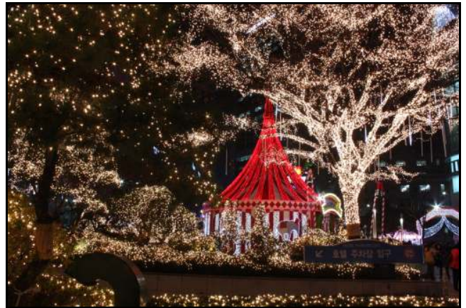
Christmas celebration in Seoul

BILATERAL POLITICAL AND ECONOMIC UPDATES