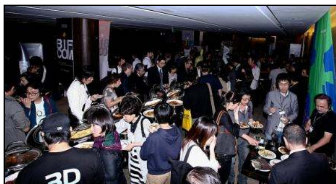
Some 220 guests attended the New Zealand reception at BIFCOM.

At the event a number of enquiries were received, with strong interest in filming and post production work in New Zealand. Media interest was positive, including interviews for New Zealand delegates with top tier broadcasting companies, and press coverage by key newspapers.