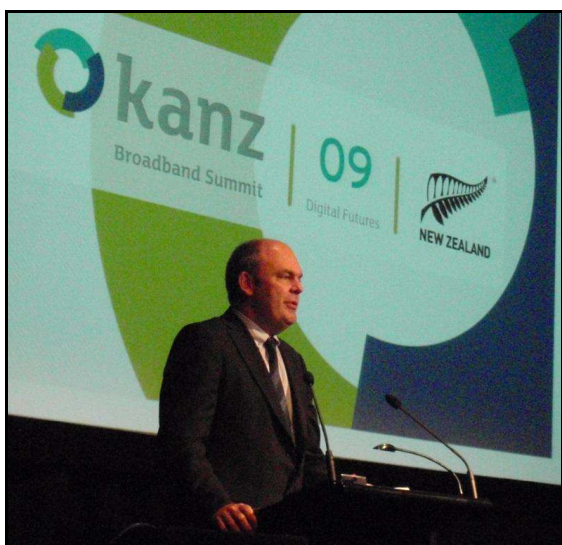
Hon Stephen Joyce, New Zealand Minister for Communications and Information Technology gave the opening address.

was focused on the economic outcomes that result from robust high-speed broadband infrastructure.