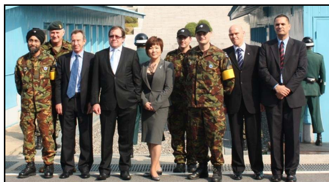
The Minister and party with Seoul-based representatives at Panmunjom, in front of the demarcation line.

field and was provided with briefings on the status of the Armistice Agreement. The Ambassador hosted a reception in honour of Mr McCully for friends of New Zealand and high level contacts including parliamentarians, trade and business representatives, defence and rugby contacts and other VIPs. The Minister also met with Representative Park Jin, Chairman of the National Assembly's Unification, Foreign Affairs and Trade Committee.