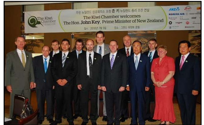
The Prime Minister with Kiwi Chamber board members.