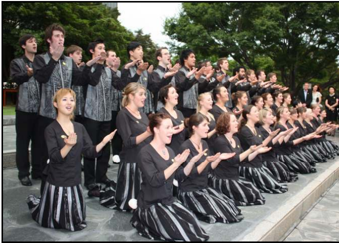
The New Zealand Youth Choir captivated the guests in the evening.