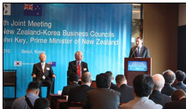
The Prime Minister delivered closing remarks at the KNZBC meeting.

The Prime Minister delivered closing remarks at the 26 th Joint Annual Korea-New Zealand Business Council (KNZBC) meeting where he again highlighted the importance of securing a high quality comprehensive FTA with Korea. He reflected warmly on his time in Korea and he expressed optimism for further collaboration with Korea across a wide range of sectors. The Prime Minister presented KNZBC export awards to Sanfords Fisheries and Hyundai Motors.