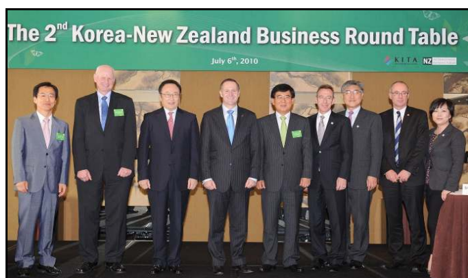
Prime Minister Key gave an opening address at the Korea-New Zealand Business Roundtable meeting.