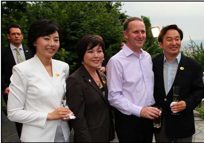
The Prime Minister and Melissa Lee MP with Korean lawmakers Reps Won Hee-ryong and Cho Yoon-sun at the reception.