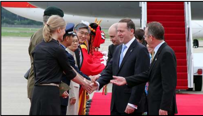
Prime Minister Key received a red-carpet welcome upon arriving in Seoul on 4 July.