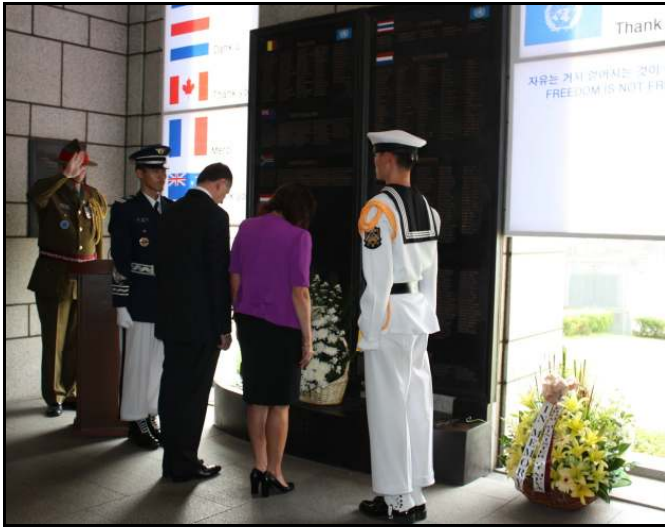
Prime Minister Key and Mrs Key laid a wreath in front of the New Zealand Roll of Honour at the War Memorial.