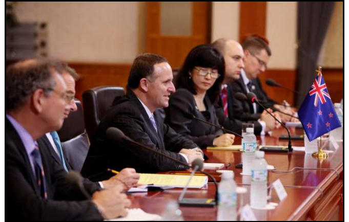
The Summit meeting focused on the bilateral FTA.