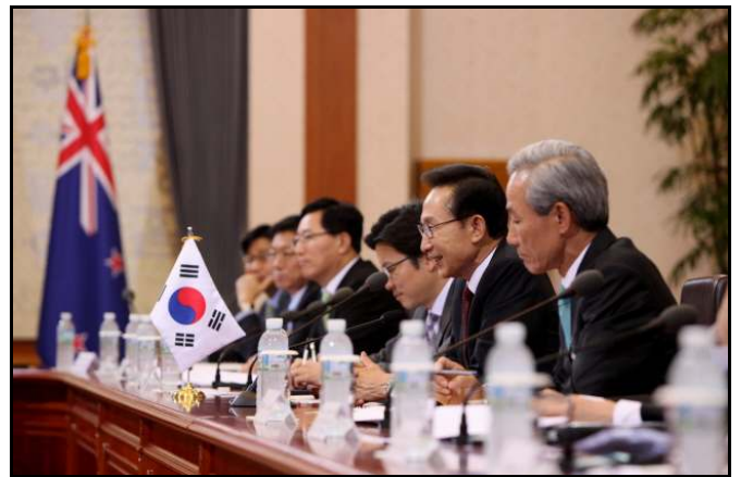
2012 has been designated as Korea-New Zealand Year of Friendship at the Summit meeting.

On the afternoon of 5 July the Prime Minister met with President Lee Myung-bak at the presidential palace Cheongwadae (the Blue House). Their Summit meeting lasted one and a half hours, and focused on the need to advance the bilateral FTA. At the same time, Mrs Key met with First Lady Kim Yoon-ok in a separate meeting.