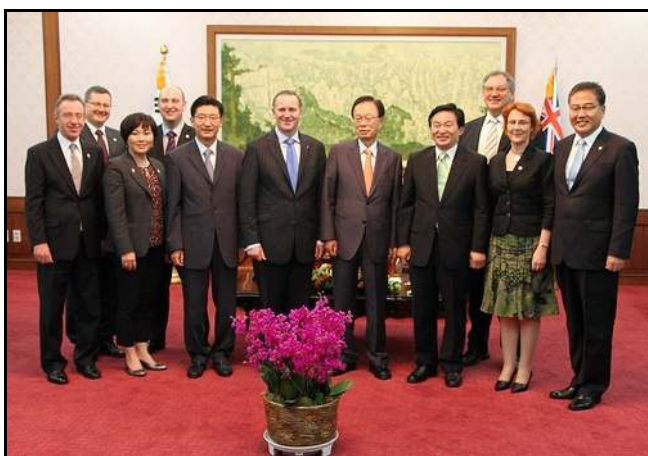
The Prime Minister with former Prime Minister's Fellows to New Zealand at the Korean National Assembly.