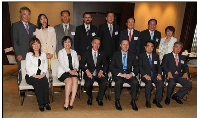
The Prime Minister updated the Te Papa Club members on efforts to enhance tourist experiences in New Zealand.

In the afternoon the Prime Minister met with the Te Papa Club, a group of senior Korean travel and tourism CEOs who promote New Zealand in the domestic market. This meeting gave Mr Key, who is also the Minister of Tourism, a chance to update the CEOs on efforts underway in New Zealand to enhance tourists' experiences in New Zealand.