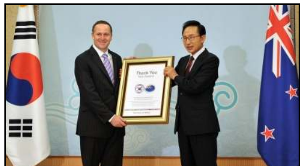
President Lee presented a thank you plaque to Prime Minister Key for New Zealand's participation in the Korean War.