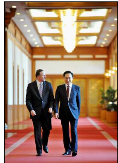
Prime Minister Key and President Lee walking to the Summit meeting room.