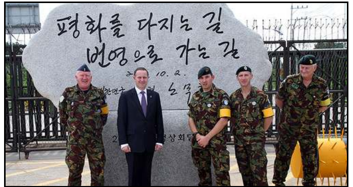
Prime Minister Key met the New Zealand military personnel stationed in South Korea at the DMZ.

Prime Minister Key and his delegation then travelled together out to the Demilitarised Zone (DMZ) separating the two Koreas to get a first hand sense of Korea's security challenges. It was a beautiful day and there was good visibility across the border into the Democratic People's Republic of Korea (DPRK) as well as across the lush vegetation and rice fields on the South Korean side. White herons were visible in the area which is renowned as a habitat for rare Korean species of animal and plant life.