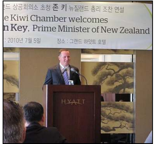
Prime Minister Key addressing the Kiwi Chamber.

In the morning the Prime Minister gave informal remarks at a gathering of around 90 members of the New Zealand business and residence community in Korea, hosted by the New Zealand Chamber of Commerce (also known as the Kiwi Chamber). He touched on themes such as New Zealand's economy, the 2011 Rugby World Cup and relations between New Zealand and Korea.