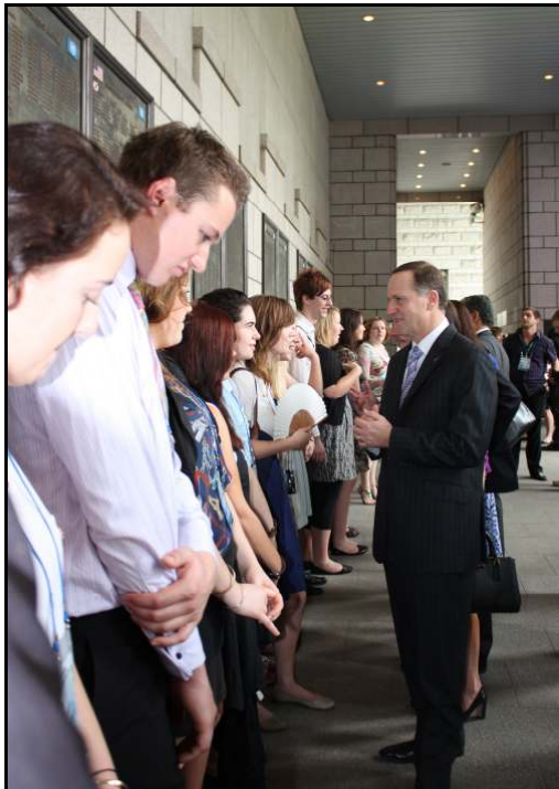
Prime Minister Key met a group of young New Zealand descendants of Korean War veterans.

The Prime Minister had a bilateral meeting with Korean Prime Minister Chung Un-chan. They discussed the bilateral Free Trade Agreement negotiations, inter-Korean relations and climate change.