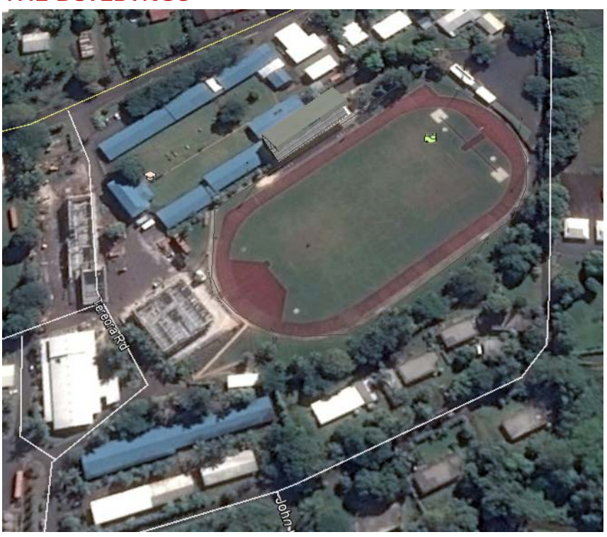
Figure 1: Tereora College site, showing foundations of Stage 1 buildings under construction