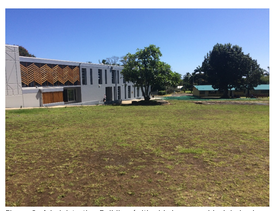
Figure 2: Administration Building (with old classroom block in background)