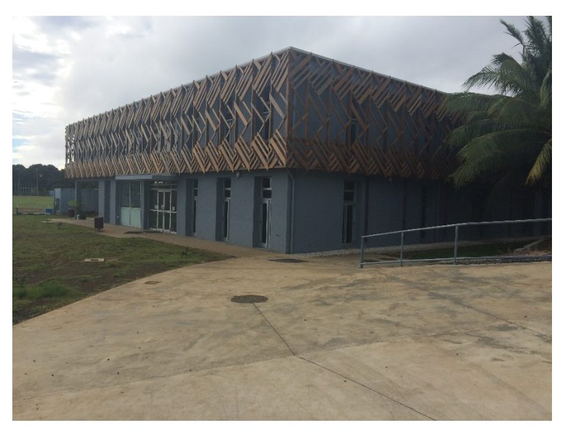
Figure 3: Technology Building