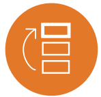
HIGH CLIMATE IMPACT