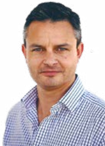
HON. JAMES SHAW Minister for Climate Change