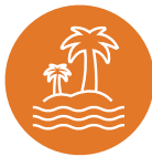
LOSS & DAMAGE