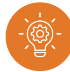
ENCOURAGING INNOVATION, ACCEPTING RISKS