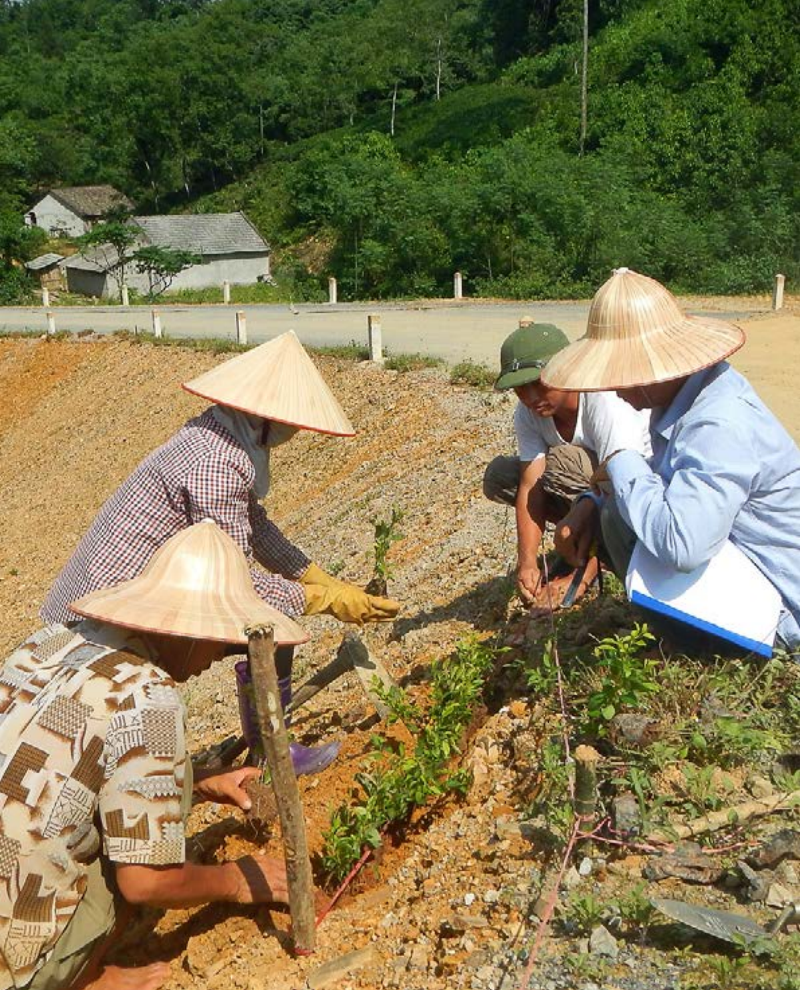
NATURAL DEFENCES: Workers at a bio-engineering demonstration site in Thai Nguyen Province in Viet Nam plant road edges to protect against the more frequent high rainfall events that climate change brings. The project is funded by the Global Environment Facility, the world's largest multilateral fund focused on enabling developing countries to invest in nature. Aotearoa New Zealand has recently increased its contribution to the GEF, which can mobilise funding to provide support and expertise at a scale we cannot achieve alone. Linking up with these large facilities allows our funds to reach further, while still focusing tightly on our priority areas such as combined action on biodiversity loss and climate.