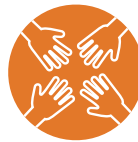
COLLABORATION IS CRITICAL