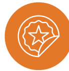
EQUITY & INCLUSION