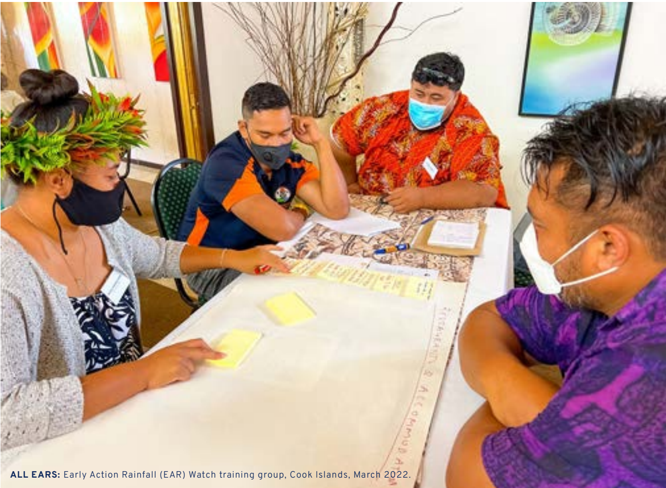
ALL EARS: Early Action Rainfall (EAR) Watch training group, Cook Islands, March 2022.

This approach reinforces our aim of promoting a partner-led, community-enabled model of responding to the challenges of climate change.