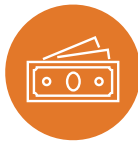
ACTING AT SCALE