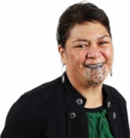
HON. NANAIA MAHUTA Minister of Foreign Affairs