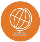
PACIFIC FOCUS, GLOBAL IMPACT