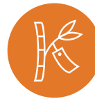
SUPPORTING BIODIVERSITY, OCEANS & NATURE

This Strategy is intentionally high-level in terms of its vision, value propositions, goals and outcomes. It is designed to be flexible as the external environment changes and new technologies emerge in the future.