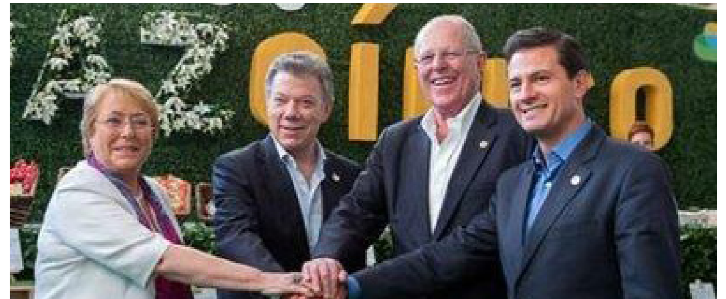
(Left to right) President Michelle Bachelet (Chile), President Juan Manuel Santos (Colombia), President Pedro Pablo Kuczynski (Peru) and President Enrique Peña Nieto (Mexico).