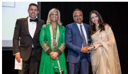
New Zealand PM Jacinda Arden (far right) with awardees at the 10th Annual Indian Newslink Indian Business Awards in Auckland