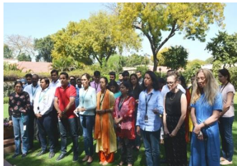
New Zealand High Commission staff members sing a waiata in memory of the victims of the Christchurch terrorist attack

attack that left 50 men, women and children dead was condemned in the strongest terms as the nation stood together in grief and in solidarity with the victims and their loved ones. As we slowly move from darkness into the light, towards what can only be described as a new normal, I would like to thank each one of you for your support and the heartfelt messages of condolence and empathy you sent us. New Zealand remains a land of peace, and the language it speaks continues to be one of love and unity: Ko tātou, tātou—We are one.