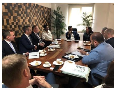
With NITI Aayog CEO Amitabh Kant

We welcomed a high-level delegation from the New Zealand aviation and tourism sectors in September, including representatives from Auckland Airport, Tourism New Zealand, Ngāi Tahu and Whale Watch Kaikōura. They had constructive engagements with the Indian government and private sector to promote better connectivity between New Zealand and India, including by working towards a direct flight.