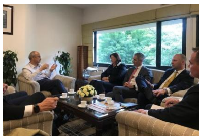
With Civil Aviation Secretary Pradeep Singh Kharola

We welcomed a high-level delegation from the New Zealand aviation and tourism sectors in September, including representatives from Auckland Airport, Tourism New Zealand, Ngāi Tahu and Whale Watch Kaikōura. They had constructive engagements with the Indian government and private sector to promote better connectivity between New Zealand and India, including by working towards a direct flight.