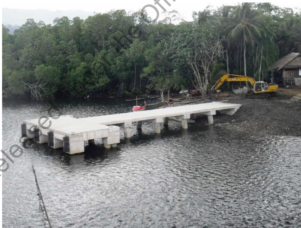
Figure 4 – Nu'usi Wharf Looking West