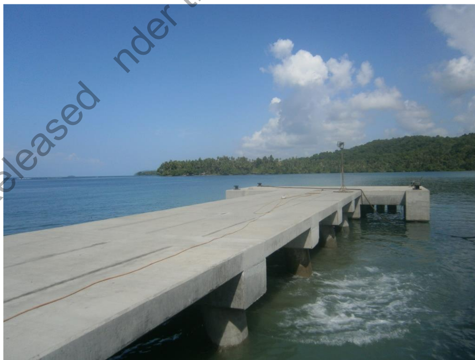
Completed Susobona wharf