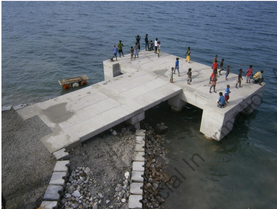
Completed Ngasini wharf