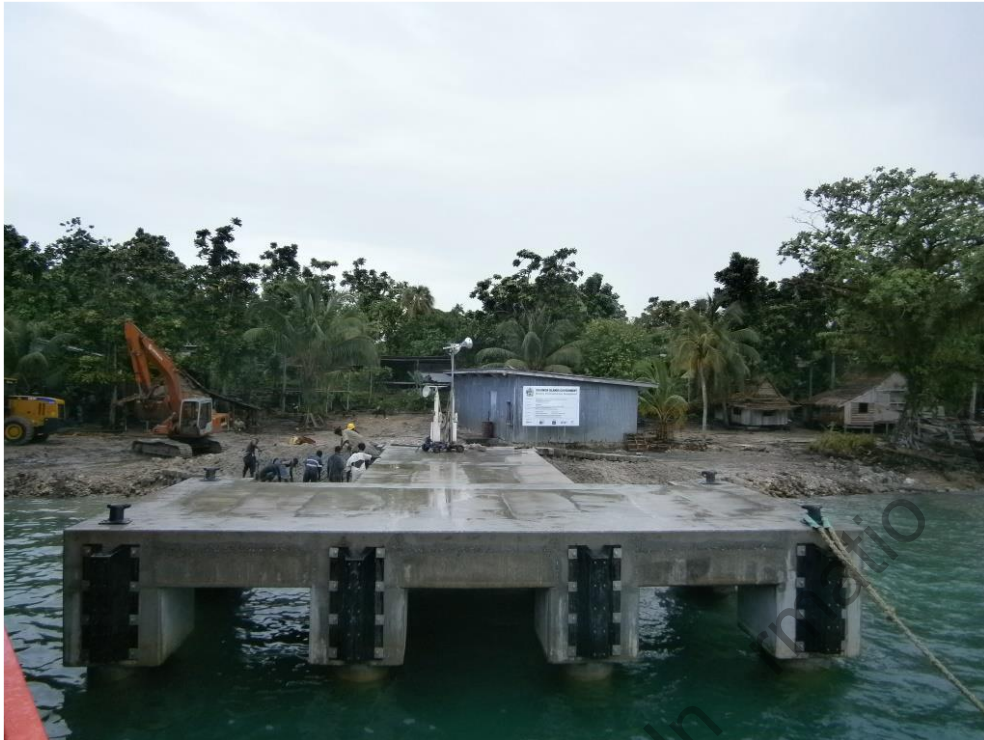
Completed Keru Wharf