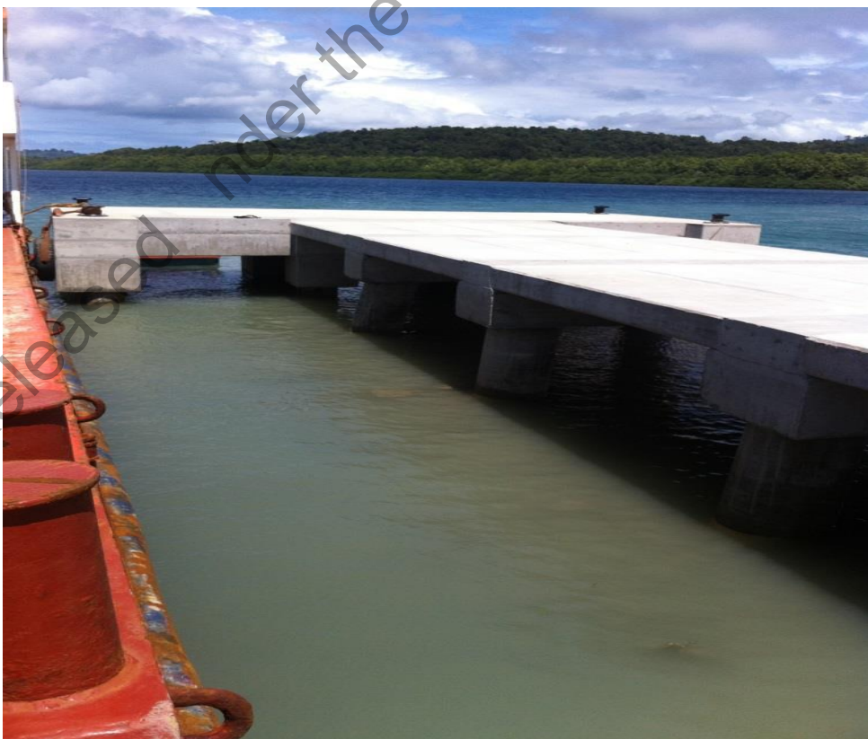
Tatamba wharf head and approach bridge