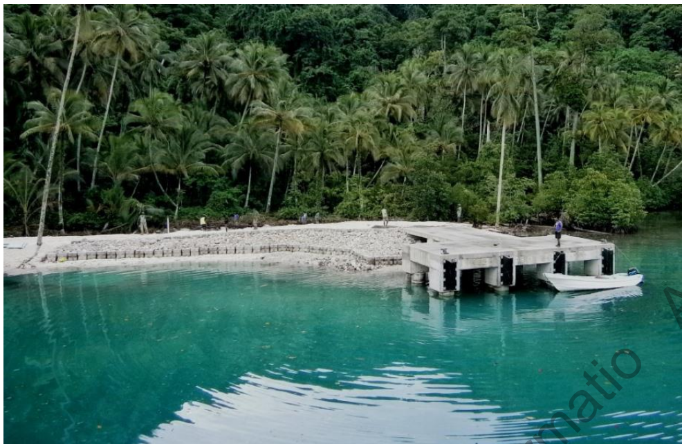
Figure 4 – Katurasele Wharf