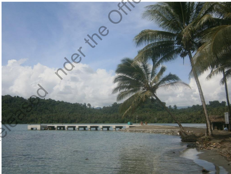
Completed Susobona wharf