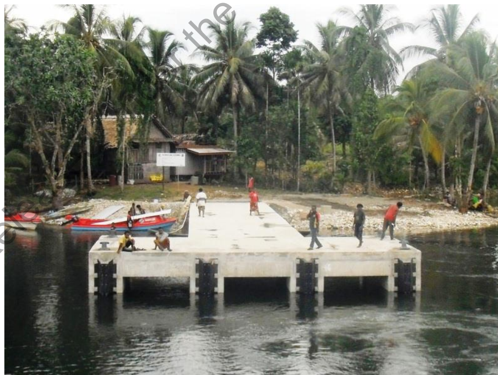
Figure 5 – Nu'usi Wharf and Landing Craft Area