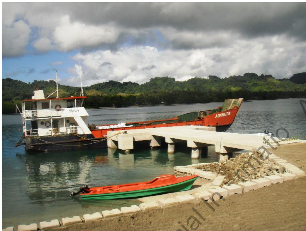
Figure 2 – Niumara Wharf