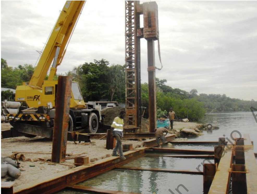
Figure 6 – Mbunikalo Piling,