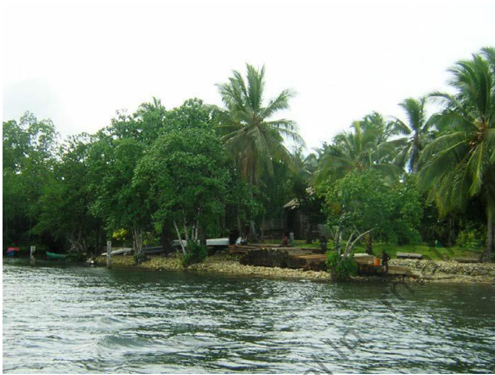
Figure 1 – Nu'usi Site in 2009