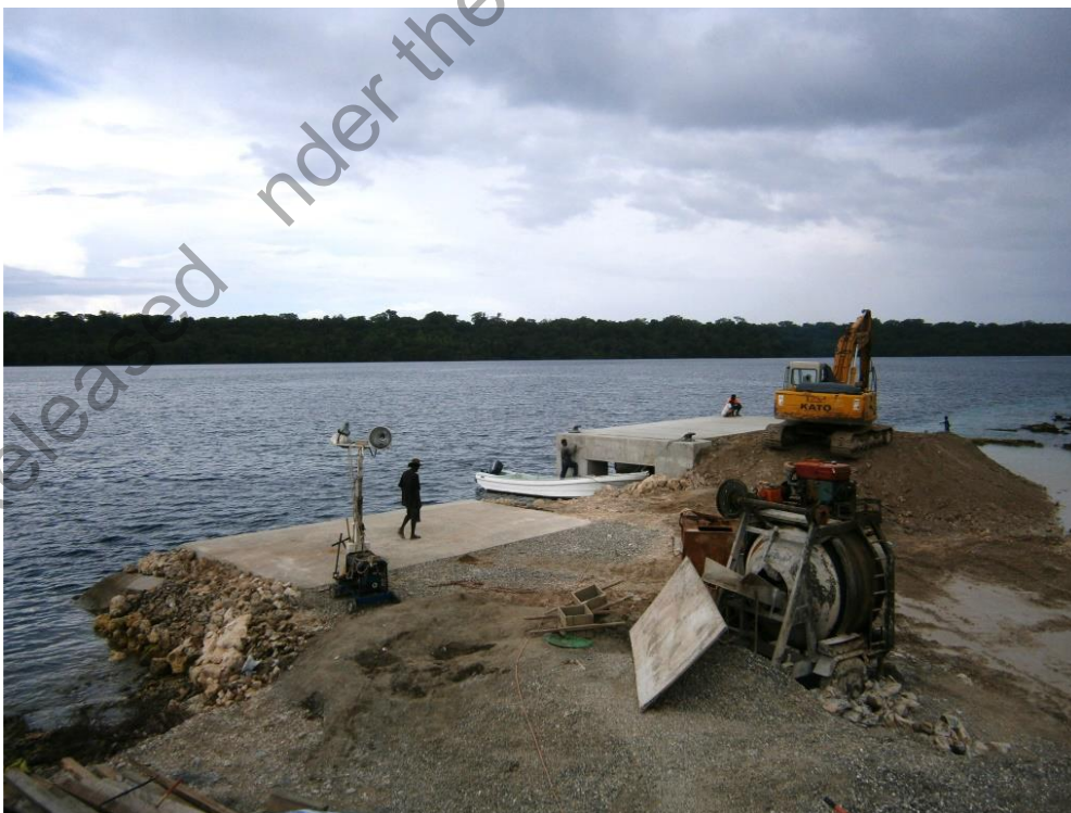
Figure 3 – Mbunikalo Wharf and Landing Craft Apron