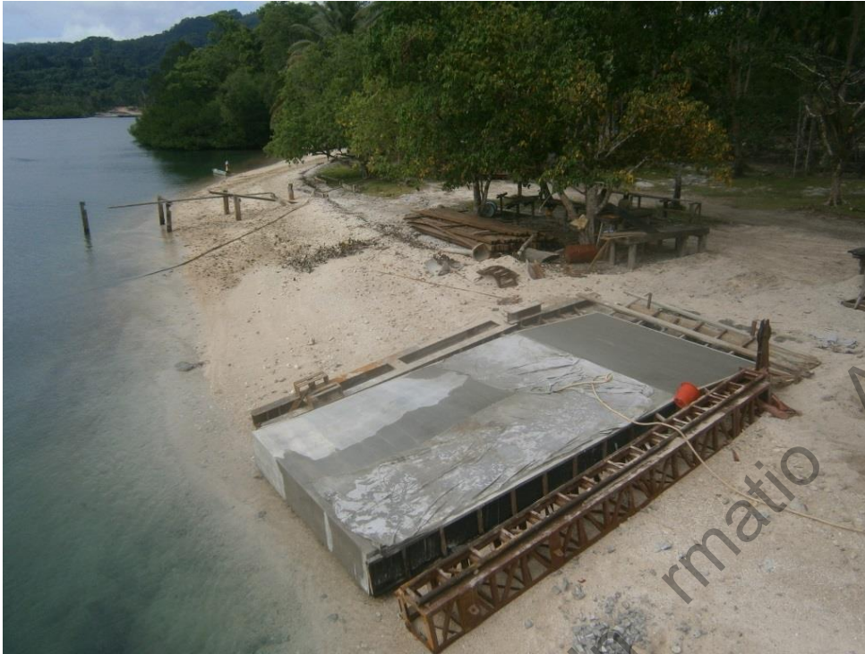
Uhu Concrete Ramp