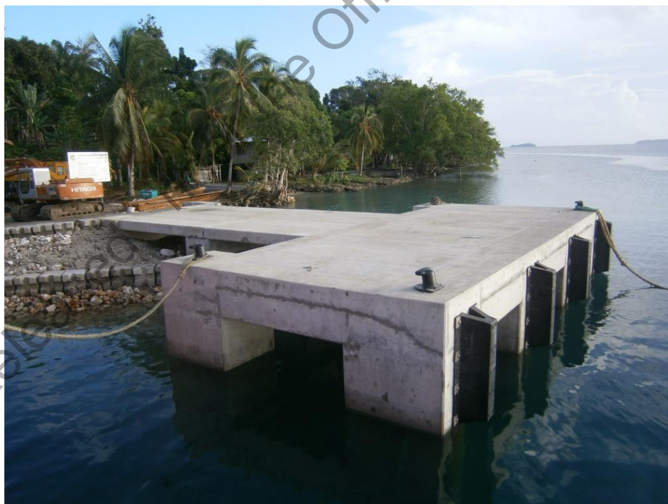
Completed Ngasini Wharf