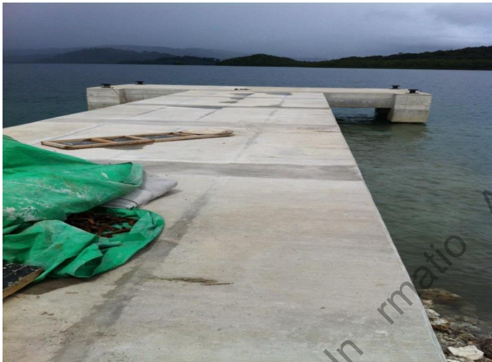
Tatamba wharf head and approach bridge