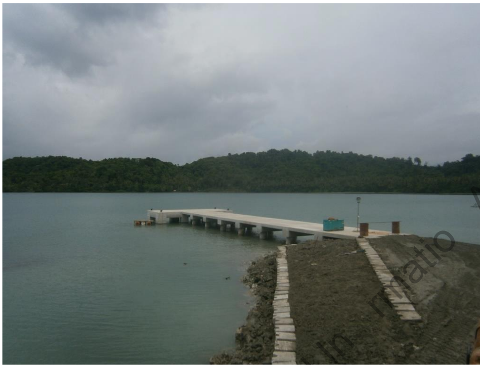
Completed Susobona wharf