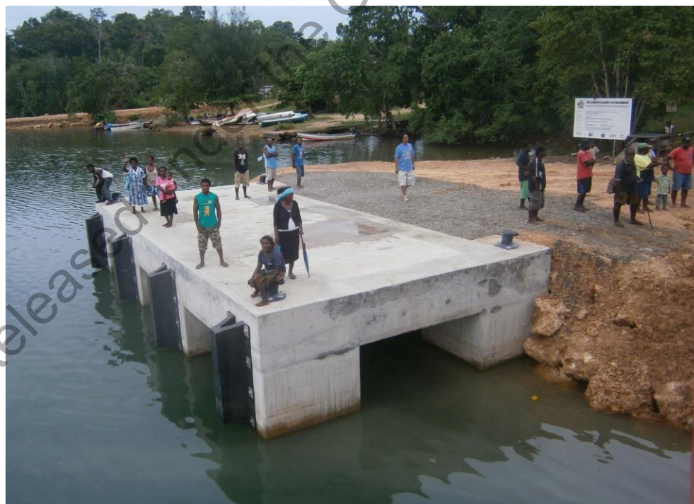
Completed Ringgi Wharf