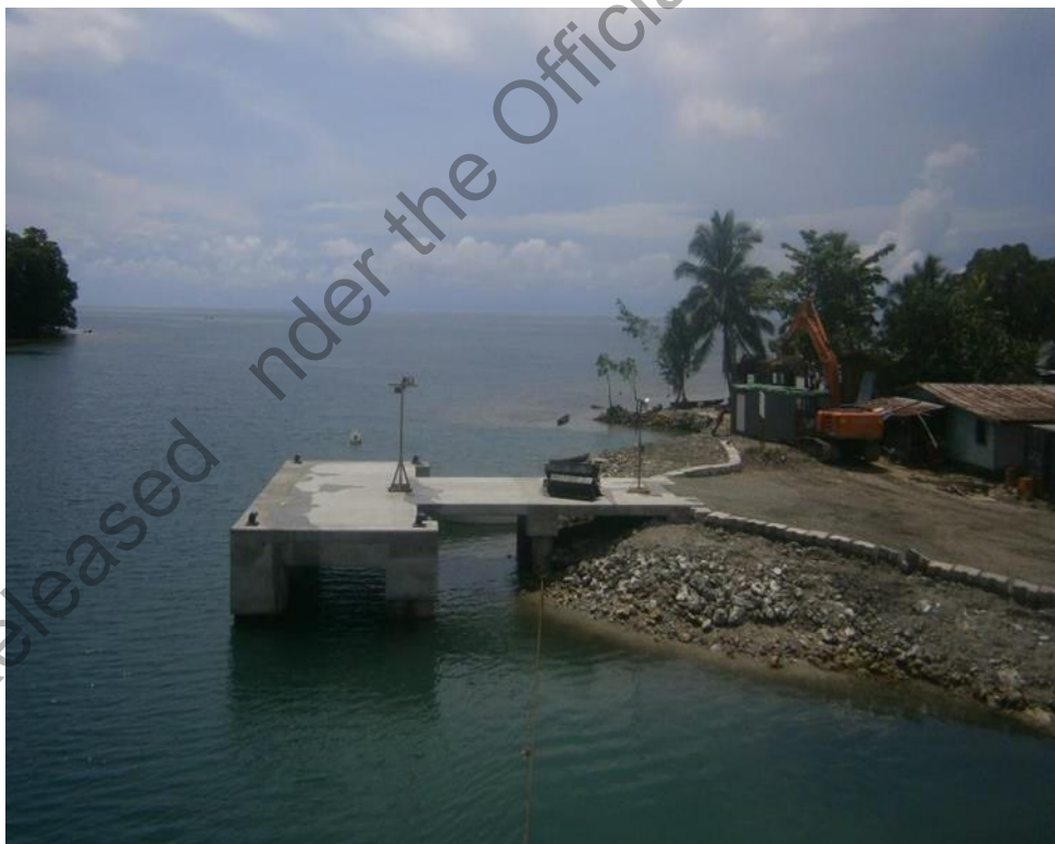
New Lambulambu Wharf