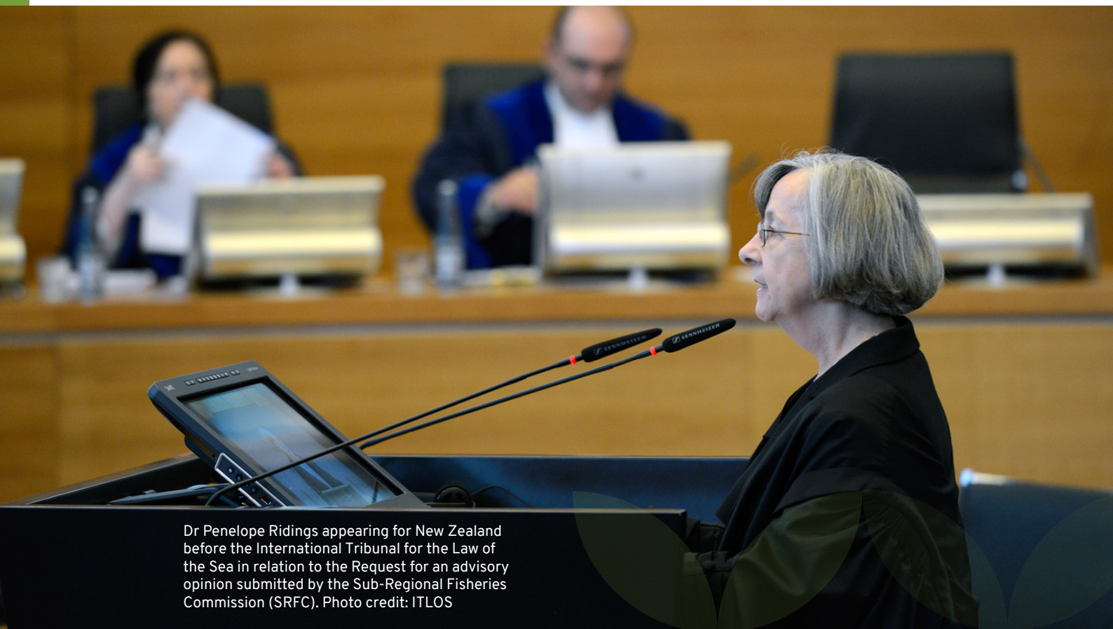
Dr Penelope Ridings appearing for New Zealand before the International Tribunal for the Law of the Sea in relation to the Request for an advisory opinion submitted by the Sub-Regional Fisheries Commission (SRFC).