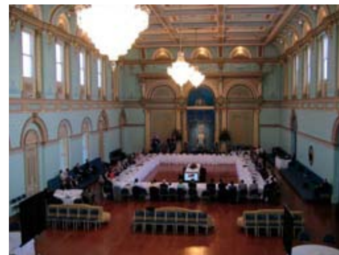
RIGHT: The Australia New Zealand Leadership Forum in action at Government House in Melbourne, April 2005.

The second Forum was held in Government House in Melbourne in April 2005. This meeting determined that in an increasingly globalised world, where both countries face many of the same economic challenges, it was essential to target impediments in areas like taxation and banking in order to create a more efficient and competitive business environment that would allow the CER economies to compete successfully in regional and international markets. This has particular relevance in the context of the CER partners’ positioning in the fast-growing Asia-Pacific region.