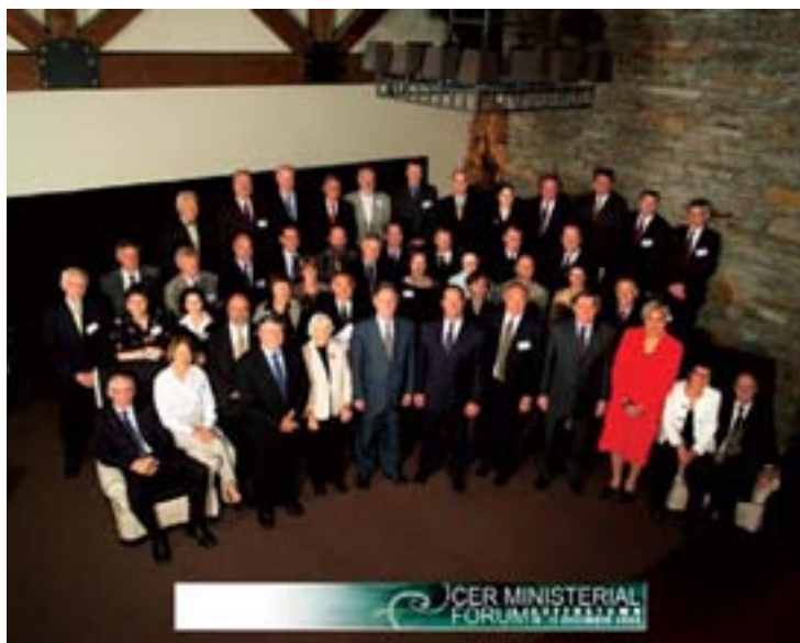
RIGHT: The 2004 CER Ministerial Forum held in Queenstown included six key economic and trade Ministers - on the Australian side; Trade Minister Mark Vaile, Agriculture Minister Warren Truss, and Industry Minister Ian Macfarlane; and on the New Zealand side; Trade Minister Jim Sutton, Economic Development Minister Jim Anderton, and Commerce Minister Margaret Wilson.

The concept of a Single Economic Market between New Zealand and Australia first saw the light of day at government-to-government level at the January 2004 annual meeting between Australian Treasurer Mr Peter Costello and New Zealand Finance Minister Dr Michael Cullen. At that time the two Ministers agreed to a number of initiatives relating to banking supervision and improved cooperation and coordination on competition policy, with the long-term goal of enabling a properly constituted Australian company to function as a company in New Zealand as of right, and vice versa. These developments were endorsed at a meeting between New Zealand Prime Minister Helen Clark and her Australian counterpart, John Howard, on 3 March 2004.