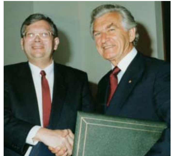
hi-res to be scanned