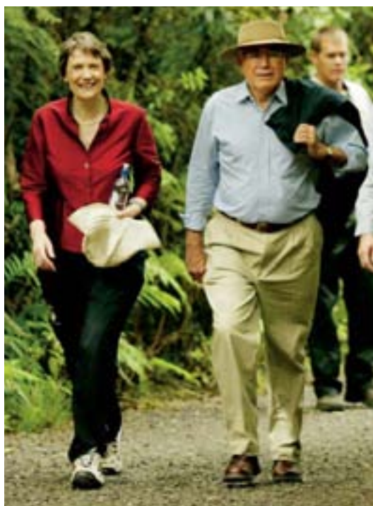
RIGHT: New Zealand Prime Minister Helen Clark and Australian Prime Minister John Howard enjoy an afternoon bushwalk at West Auckland's Waitakere Ranges after their annual bilateral, February 2005.

This cooperation has been strengthened further by the closeness of the two countries through kinship, business and social relationships, travel, and the increasing integration of the Australian and New Zealand markets.