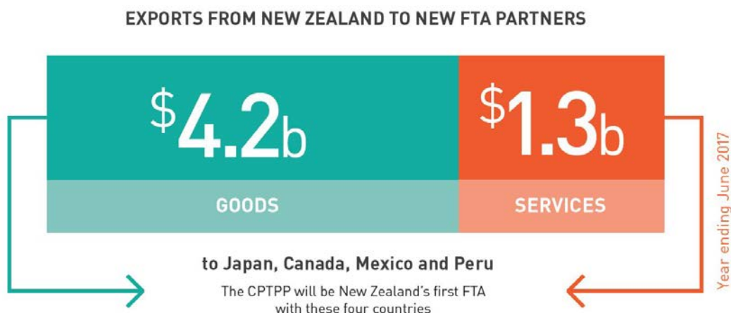
Table 1.1: Exports from New Zealand to new FTA partners

CPTPP will serve as a platform to support the integration of New Zealand business into regional supply chains and will provide greater certainty to traders and investors in TPP markets. The agreement also provides a pathway to wider regional economic integration as it will be open to new members to join in future.