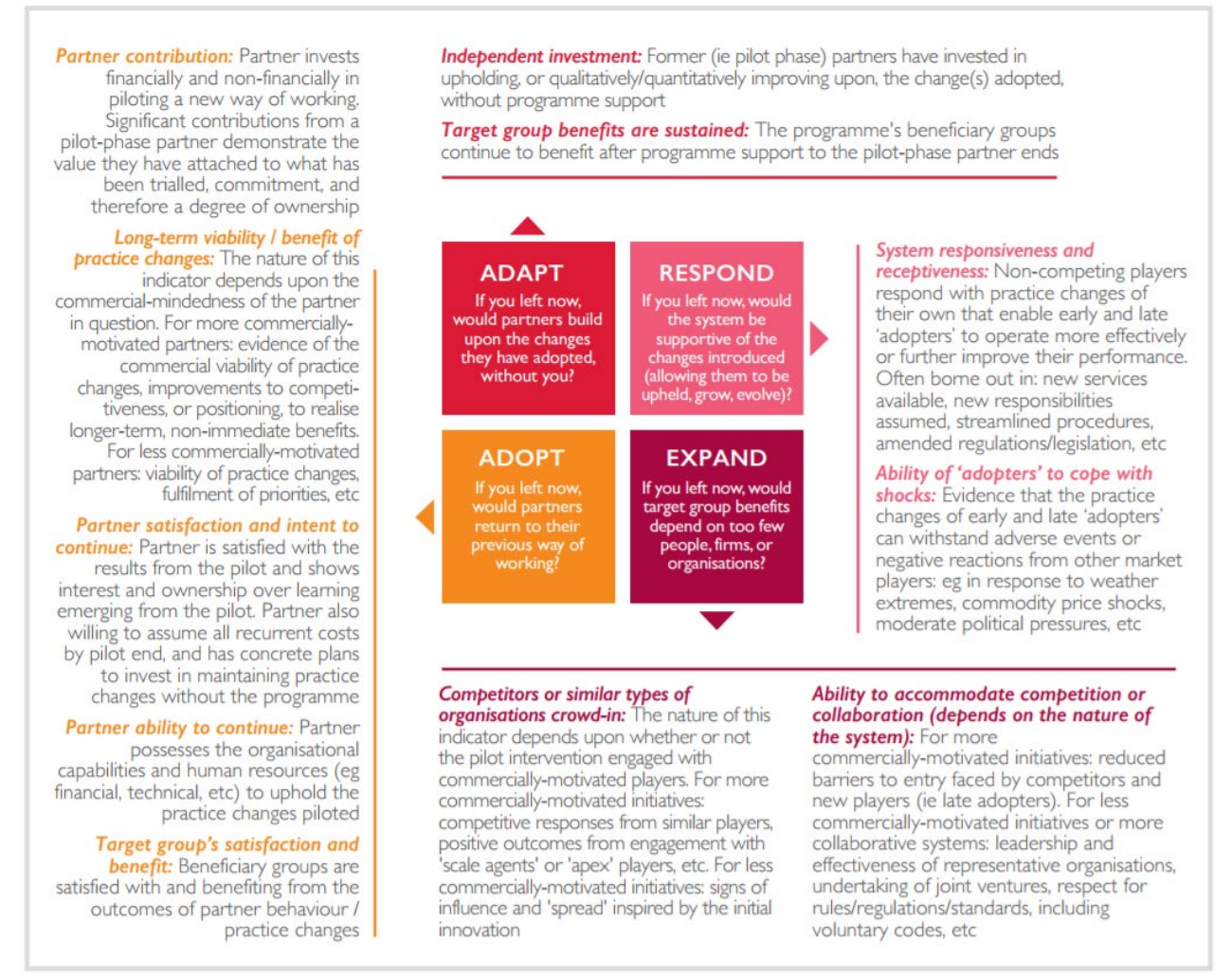
Figure 4 The Springfield Centre Framework for Monitoring and Evaluating Systemic Change