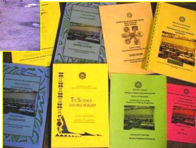
TIT Programme, Course Materials