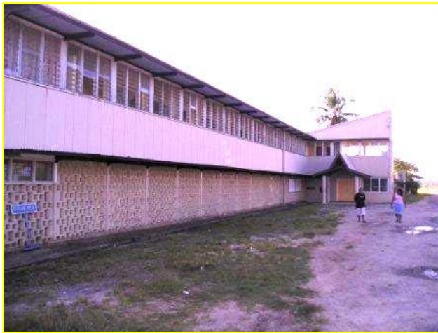
Administration Block, SoE, Panatina